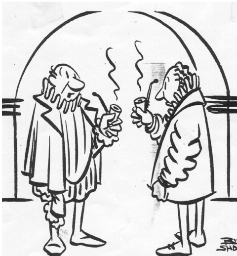
"I know it tastes funny—but think of how you'll be able to tax it."

And so it now comes time to fund the anti-tobacco programs and what does the SD city council do? No problem. We'll just go out and tax the smoking public and get the money all over again. And to top it off they have the gall to pull out the old and tired "save the children" banner as they strike their blow for humanity. Shameful, just shameful. Where was their concern for the children on the day they decided to "steal" the MSA money and use it to pay for the pension deficit instead of those programs for which it was intended.